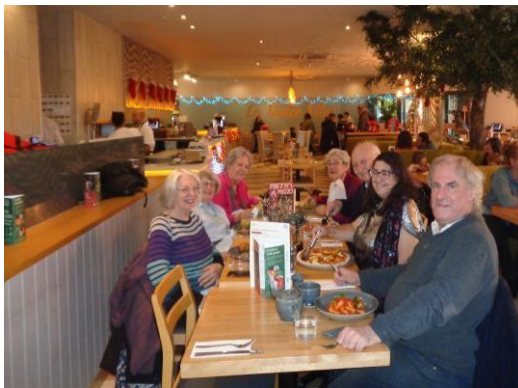
Fellowship members celebrate at Prezzo, Hemel Hempstead.