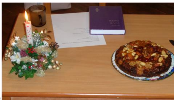
The cake, at the Fellowship.